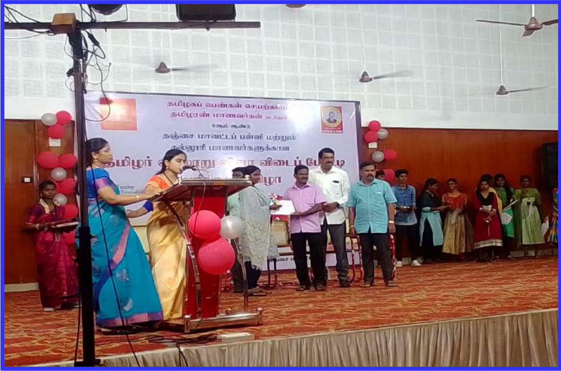
Kalaingar Centenary – Students Speech