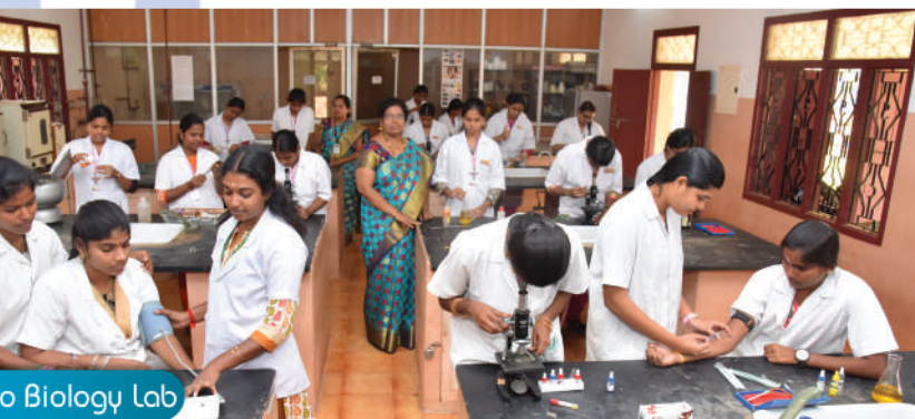
Micro Biology Lab