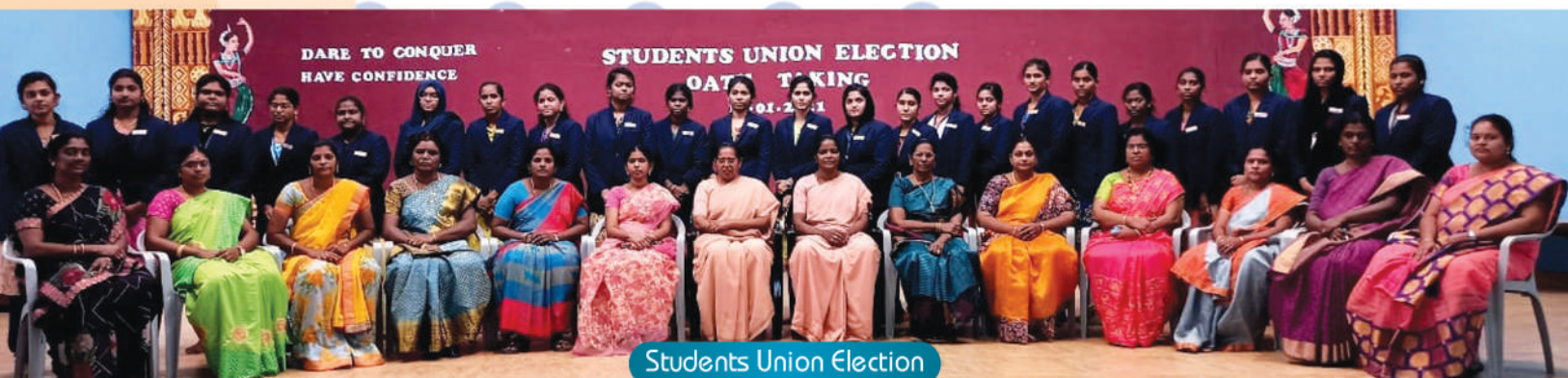
Students Union Election